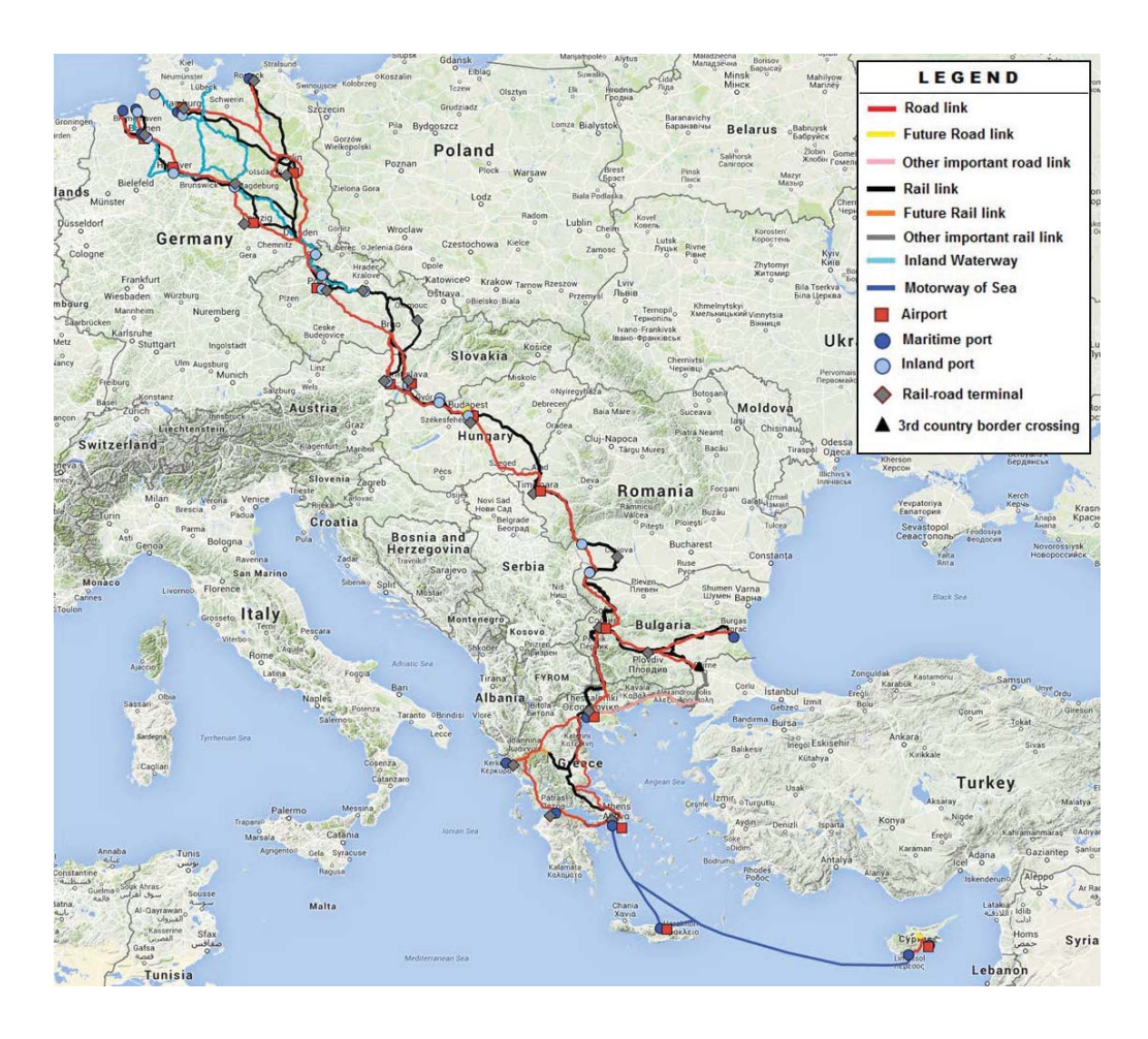
Fig.1: The OEM TEN-T Core Network Corridor, alignment and nodes

original designation as one of the priority projects, and then the modification in 2012 under the name Orient/East-Med (OEM) Corridor (Corridor No. 3 of the nine TEN-T core network corridors).