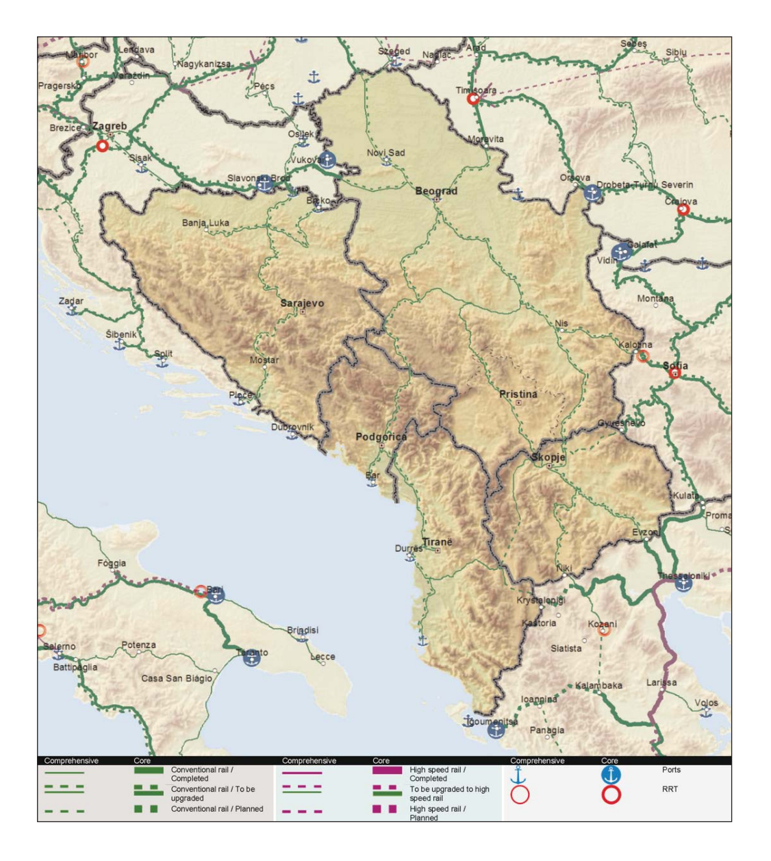
Fig. 3: Indicative extension of the TEN-T Comprehensive Rail Network for the Western Balkans region published in Regulation 2013/1315/EU

On EU territory, the Commission has given its backing to a study to assess the need for a rail link between Budapest and Athens via Timisoara (RO)–Calafat (RO)–Vidin (BG)–Thessaloniki (GR). Currently this link is not fully operational and support is needed to develop the link to the necessary extent.