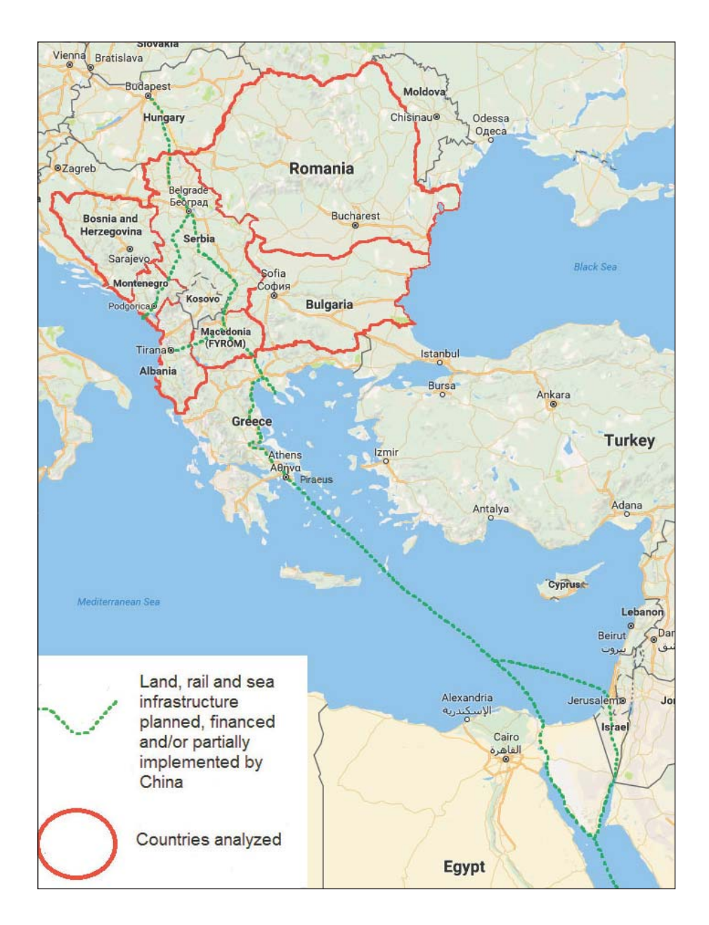
Fig. 5: The 21st Century Maritime Silk Road (MSR)-Corridor (Mediterranean section: Suez-Canal-Piraeus-Belgrade-Budapest) of China's Belt and Road Initiative (BRI)