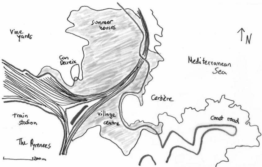
Figure 1: Overview Can Decreix and surroundings (author's creation)

In this section I describe Can Decreix, the place which led to the analysed experiences. For this I locate and describe Can Decreix in space and time, taking a place as never the same and constantly changing, influenced by people and ongoing activities.